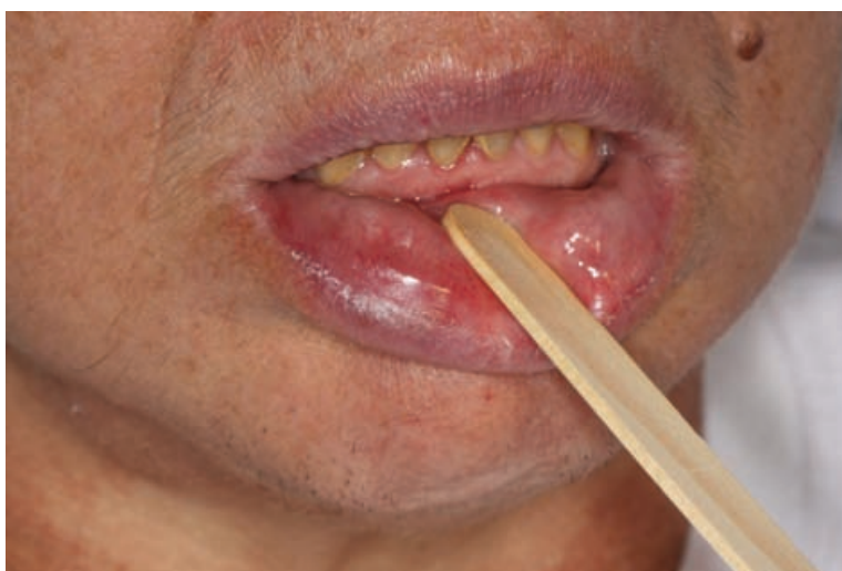
FIGURE 3 – Clinical appearance: multiple asymptomatic nodules.

A 44 year-old, afro-descendent woman, was referred to the Department of Maxillofacial Surgery at Erasto Gaertner Hospital, complaining of an asymptomatic lesion of oral mucosa detected by her dentist during routine examination. Arterial hypertension was the only relevant element of her medical history and she reported hyposalivation. Clinical examination showed multiple asymptomatic nodular lesions on lip mucosa with an average size of 3 mm and normal coloration (Figure 3). Incisional biopsy revealed adenomatoid hyperplasia of minor salivary glands after histopathological examination. After two year's follow-up, the patient has no further complaints and the lesions are stable.