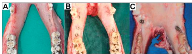
Fig. 1. Clinical features of the mandibles 90 days after implantation. A , Group A (absence of implant exposure); B group B (presence of screw cover exposed) and C group C (presence of implant screw exposure and implant mobility).

postextraction sites, in mandibles of minipigs 15 days before RT, 3 months after RT and in a nonirradiated bone.